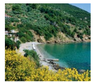
Glifoneri Beach near Skopelos Town